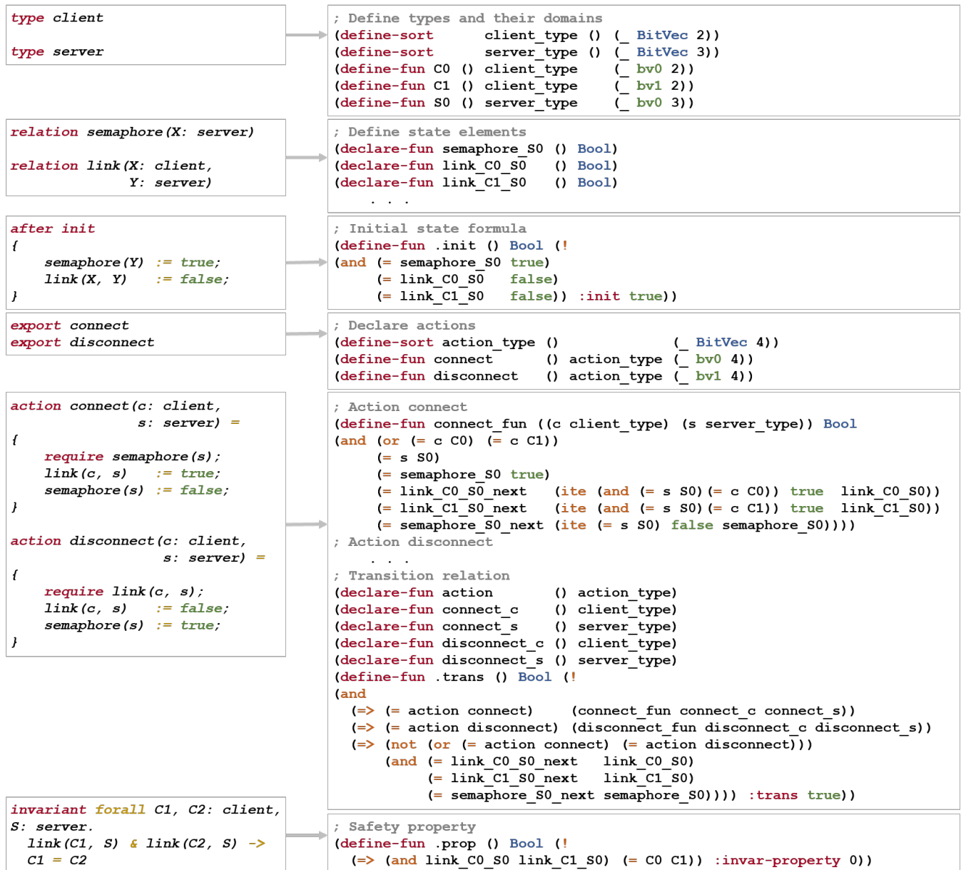
Figure 2. Translation of lock server in Ivy to a finite instance (1 server / 2 clients) in VMT. Note that our VMT representation uses different vector sizes (1 for boolean, 2 for clients, 3 for servers) as an easy way to ensure that the model-checker does not try to compare values of different types.

the unbounded case. We call such clauses instance-specific clauses. Section 5 discusses how these are pruned during invariant generalization. Note, finally, that concretization is not a panacea. It is a manual and error-prone process and should therefore be used only when necessary to overcome the limitations of model-checking.